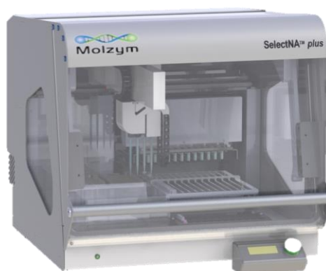
Fig. 2: SelectNA™ plus instrument for full automation of MolYsis™ pathogen DNA isolation from blood and other clinical samples.

croorganisms from samples. They are meant to be combined with any other commercial kit or in-house procedure for DNA extraction, including manual and automated protocols. Pre-treatment and DNA extraction are combined in the MolYsis™ Complete kits. All products include solutions for small to large sample volumes (0.2 to 10 ml).